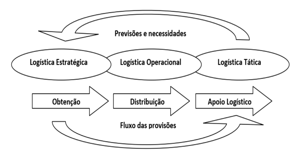
Figure 3 – The logistics doctrine of the European armies in WW I

Figure 3 shows the logistic doctrine in force in the armies of Europe, during the WW I: