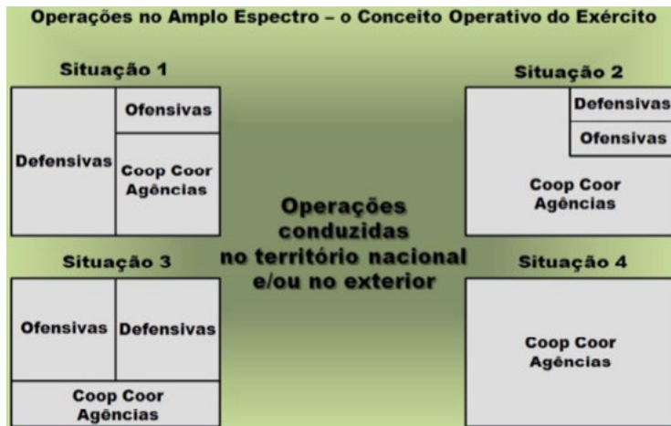
Figure 3 - Operating concept of the Brazilian Army

As a result, the Army adopted the systematic generation of forces through the system called “Capacity-Based Planning”. This model focuses on meeting the needs arising from the desired effects on military campaigns, aimed at the execution of actions and linked tasks. In this way, the systematic prioritizes the permanent analysis of the conjuncture and prospective scenarios, reducing the risks of misplaced planning, thus increasing the readiness for security and defense. In this process, the architecture is harmonized by the synergy of the seven factors - doctrine, organization, training, material, education, personnel and infrastructure - synthesized in the acronym DOAMEPI. Ultimately, the model promotes a continuous investigation about the effectiveness of the Military Land Power, so as to customize and enhance the fighting power in the face of threats (BRASIL, 2014).