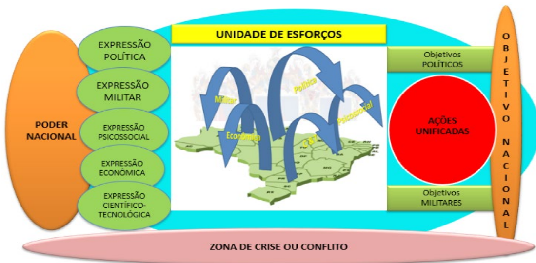
Figure 4 - Theoretical Model “Unit of Effort and Unified Actions”

On the other hand, this concept encourages the “Unit of Effort” approach (Figure 4), optimising the principle of “savings of means”, in that it avoids duplicate efforts and maximizes interoperability for optimal performance, leveraged by the pool of capabilities of the national potential. Furthermore, the “Unity of Effort” promotes common understanding of the problem generator of the crisis/conflict, shaping of a problem-oriented design and, consequently, fostering an action unified, advancing to the generation of a response to the systemic challenges of the current world, including the other expressions of National Power. Therefore, an “Unified Action” (Figure 4) is the synthesis of synchronization, coordination and/or integration of agency actions (public, private, governmental, intergovernmental and non-governmental) in the core of complex operations, whether they are joint, combined and multinational.