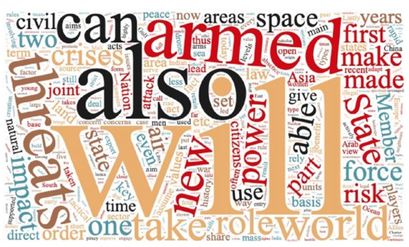
Figure 2 – Word cloud of the French Defense White Paper

Figure 2 shows graphically the most common words and subjects in the French document.