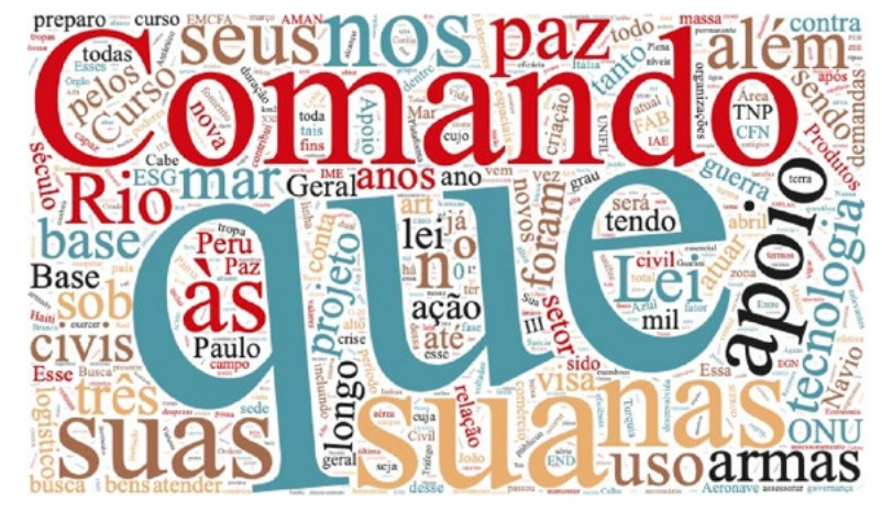
Figure 3 - Word cloud of the Brazilian Defense White Paper<sup>11</sup>

The word cloud based on the French white paper highlights a more imperative discourse compared to the German document, while the theme of threats appears more prominently throughout the text.