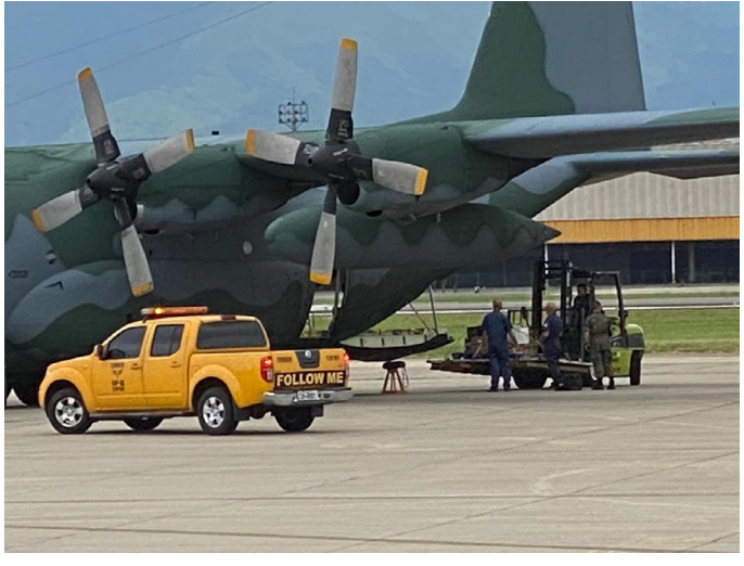
Figure 1 – Pallet handling equipment

study is similar to that used. In addition, in Figure 2, the pallets used are aeronautical, showing a problem of cargo unitization that would increase the transshipment time in joint operations.