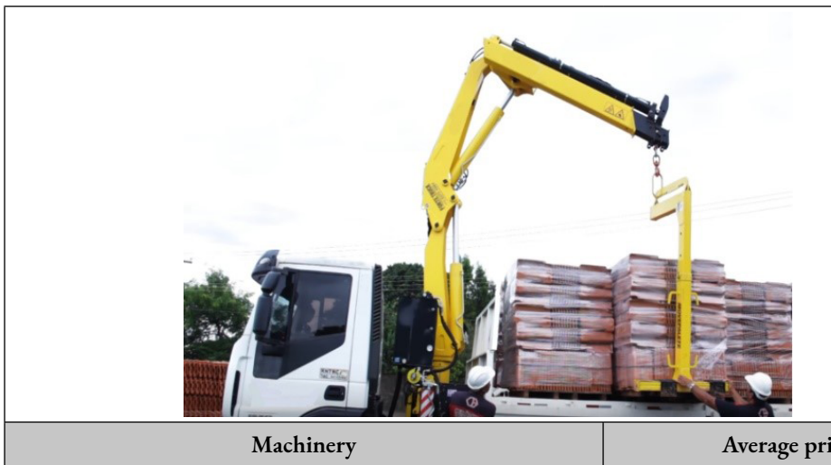
Table 4 – Truck crane with adapter to move pallets