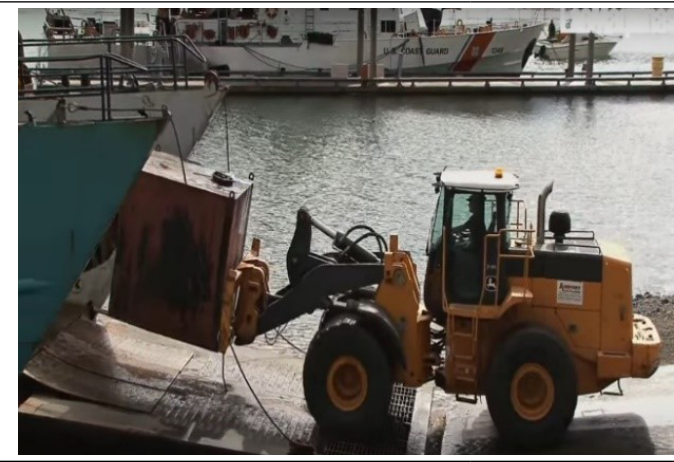
Table 5 – Pallet shipment with pallet fork tractor