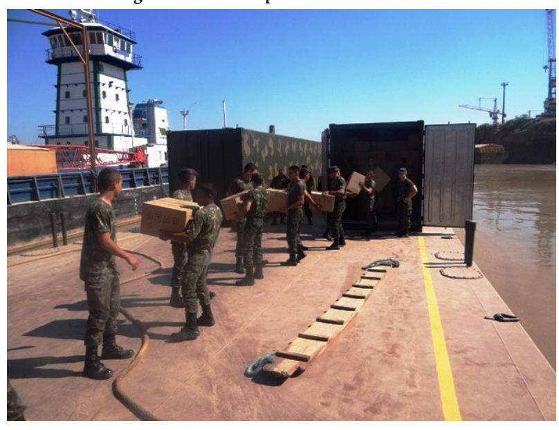
Figure 3 – Transshipment at Madeira River

At the regional level of the EB, it was observed that the Military Organizations are not always prepared to receive the material wrapped in stretch film and palletized. Then, at this level it is possible to observe that what occurs in the Amazon region is the handling of the cargo according to Figure 3 below, although it was unitized and palletized while it was transported by road.