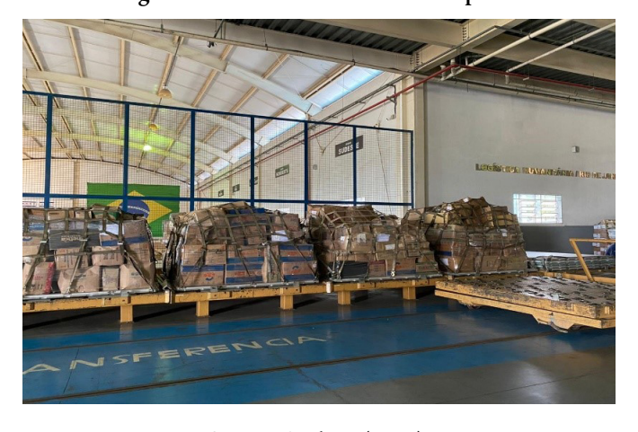
Figure 2 - 463L HCU aeronautical pallet