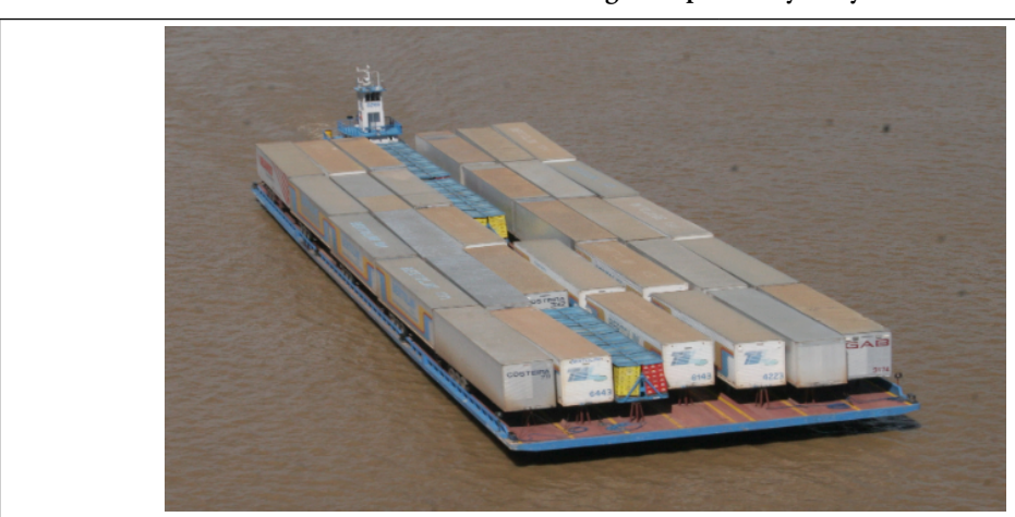
Table 6 - Box trailer being transported by ferry