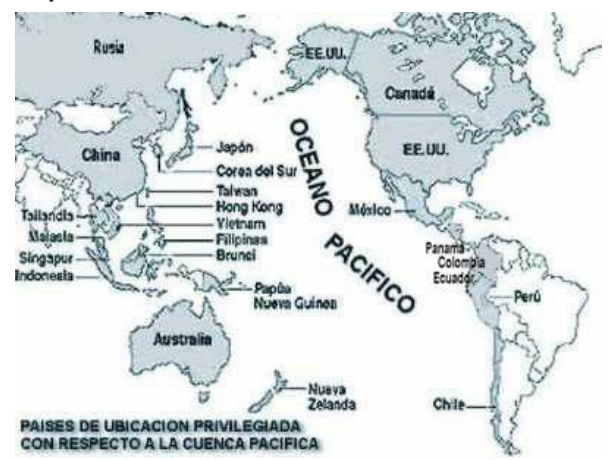
Figure I. Countries with privileged location with respect to the Pacific Rim.

The Chilean territory comprises three distinct geographic areas: America, Antarctica and Oceania, and it is thus, one of the States endowed with privileged position in face of the current global economic pole- the Pacific Rim (Figure 1).