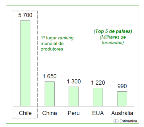
Graph I. Estimated mineral production of copper in 2013.

The most important destinations of Chilean copper exports are in Asia (52%) – where China (40%),