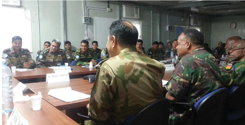
Picture 2 - MONUSCO Commanders meeting

analyse and provide recommendations on, inter alia: military or/and police concepts of operations implementation; guidance (e.g. rules of engagement/use of force) and standards; troop-to-task determinations; force/police generation processes; overall equipment needs; adequacy of support provided to uniformed personnel; welfare needs to uniformed components; training requirements of uniformed personnel and lessons learned identified and disseminated to military and police personnel.