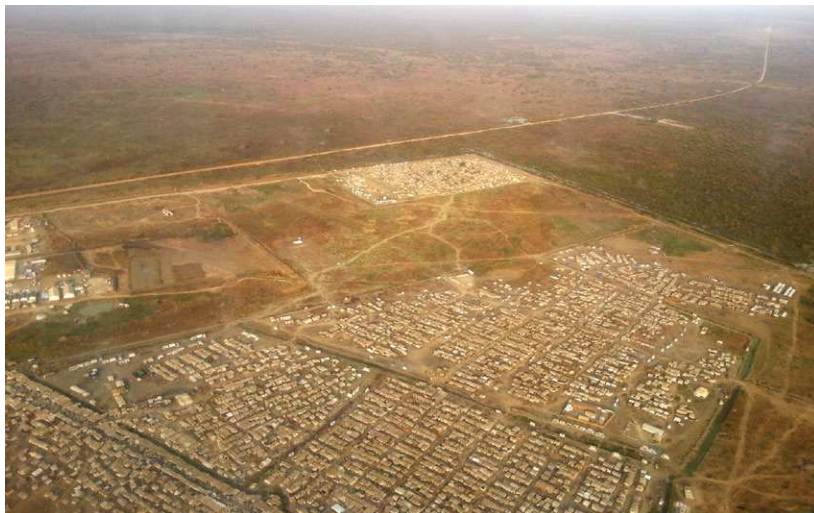
Picture 3 - UNMISS Bentiu POC Site