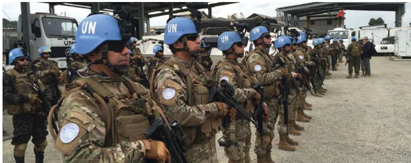
Picture 9 - CHIBATT - MINUSTAH

then will it be possible for a Mission to operate with a desired level of flexibility and be proactive in mandate implementation.