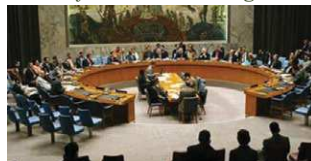
Picture 1: Security Council meeting

Meeting these demands requires strategic and operational engagement at all levels across both DPKO/DFS Headquarters and field missions to ensure that: