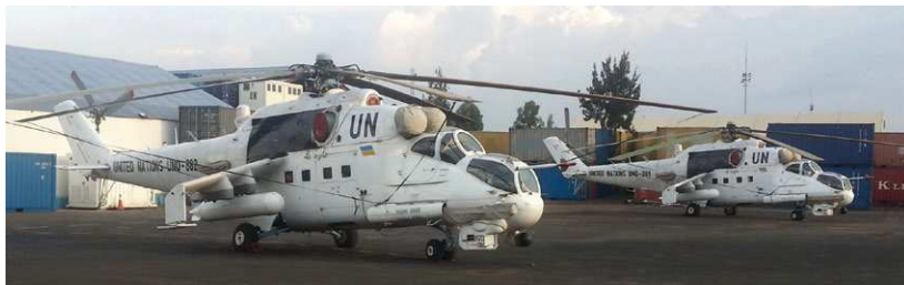
Picture 6 - MONUSCO attack helicopters

Integration is imperative to success in UN peacekeeping. Yet the multi-dimensional character of UN peacekeeping presents natural challenges to the integration of effort that is required. Adding to this,