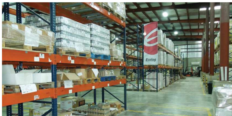
Picture 8 - MINUSTAH warehouse

Unfortunately, we have often come across gaps in these