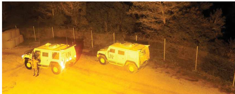
Picture 4 - UNIFIL Blue Line night patrol

The mission reviews are conducted in close collaboration and coordination with relevant TCCs/PCCs, as well as the mission's senior leadership – in particular Force Commander and Police Commissioner, and DPKO/DFS leadership.