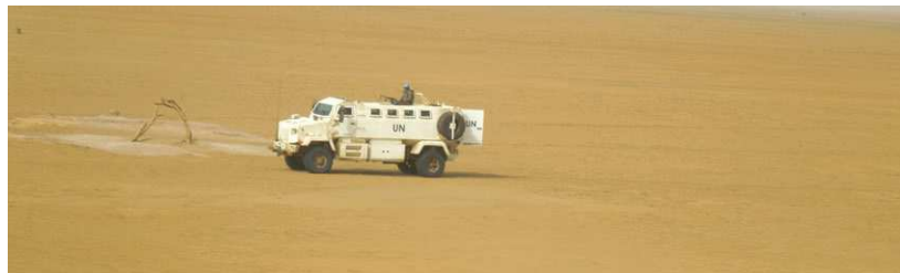
Picture 7 - MINUSMA patrol in Tabenkort/Mali

Solid Mission leadership will work as an integrated team, drawing on their own experiences in cooperation and coordination with their larger team for the good of the mission. The challenge is that appointed leadership may lack experience in working in a multidimensional PK environment that is comprised of civilians, military and police, each having very distinct cultures. This can lead to a situation where