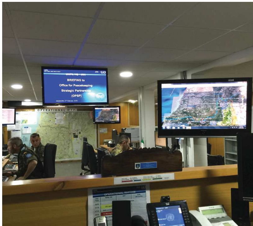
Picture 12 - Command and control centre - UNIFIL