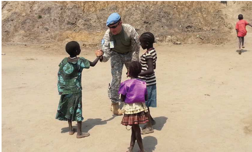
Picture 11 - UNMISS JUBA POC site

information to make prompt response to constant crises.