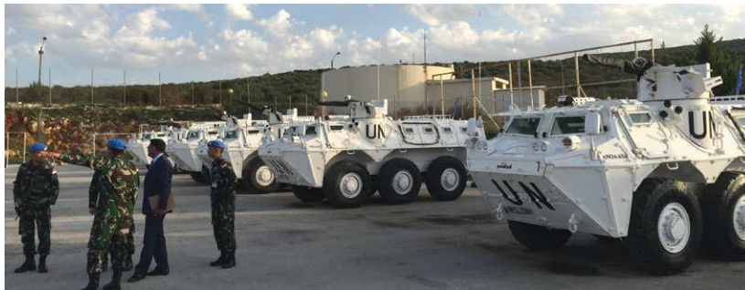
Picture 10 - INDOBATT - UNIFIL

It is important for the UN that TCCs make good use of our guidance material, directives, SOPs, manuals and key operational documents as they plan for and conducts pre-deployment training of Staff Officers, MILOBs and formed units. However, any orientation towards the UN peacekeeping environment should always be built