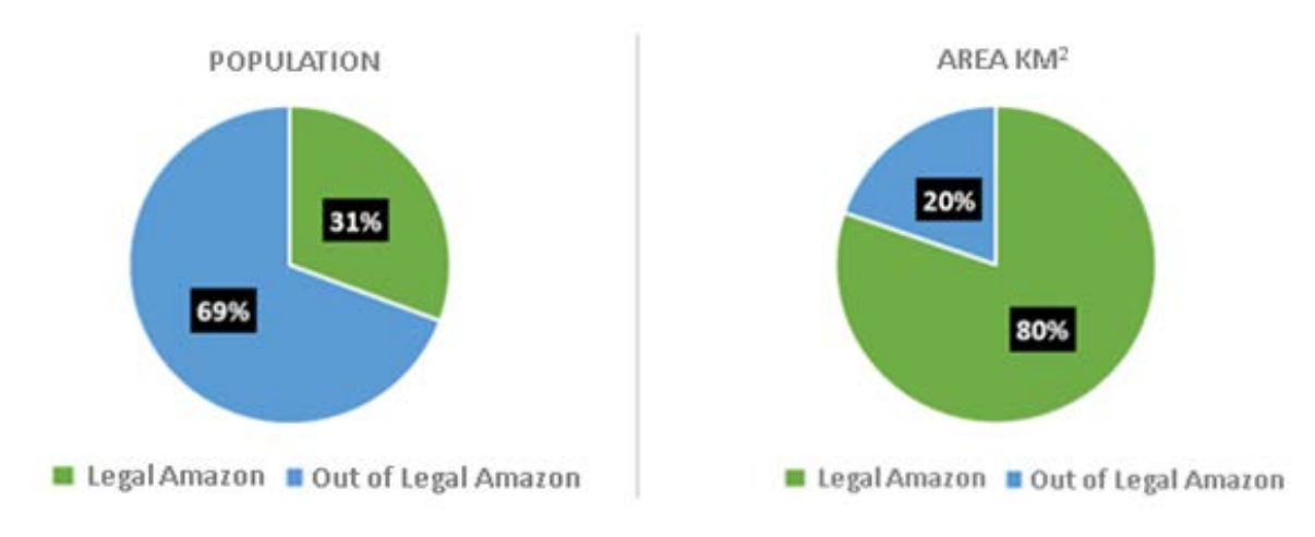
Graph 1 - Comparison of population and geographical area between the Legal Amazon Border Strip and the Border Strip outside the Legal Amazon

encompassed by the Border Strip of the Legal Amazon covers 1,787,247 km2 and that outside 438,064.1 km2. According to Graph 1, a comparison between the two areas reveals that approximately one third of individuals occupy an area approximately four times larger (IBGE, [20--]).