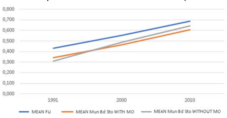
Graph 2 - Evolution of the MHDI of the universe surveyed

Legend: MEAN FU = Mean of the federative unit; MEAN Mun Bd Stp with MO = Mean of municipalities in the border strip with military organizations; MEAN Mun Bd Stp without MO = Mean of Municipalities in the Border Strip without Military Organizations; Source: prepared by the authors, 2021.